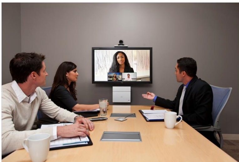
Figure 1. Cisco TelePresence SX20 Quick Set in a Small Meeting Room Environment

Now, the SX20 Quick Set supports cloud registration to Cisco Spark Services for even faster and more cost effective deployment 1 . Cisco TelePresence SX20 Quick Set is designed to truly extend the power of in-person to everyone, everywhere.