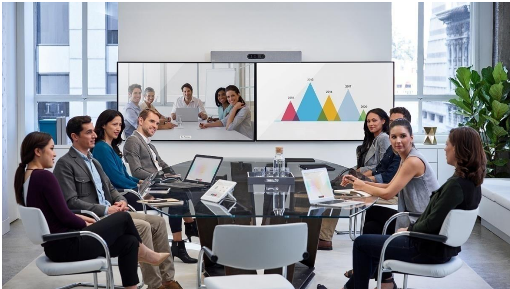
Figure 1. Cisco Spark Room Kit Plus in Large Conference Room

The Room Kit Plus – comprising a powerful codec and a quad-camera bar with integrated speakers and microphones – is ideal for rooms that seat up to 14 people. It offers sophisticated camera technologies that bring speaker-tracking and auto-framing capabilities to medium to large-sized rooms. The product is rich in functionality and experience but is priced and designed to be easily scalable to all of your conference rooms and spaces – whether registered on the premises or to Cisco Spark through the Cisco® Collaboration Cloud.