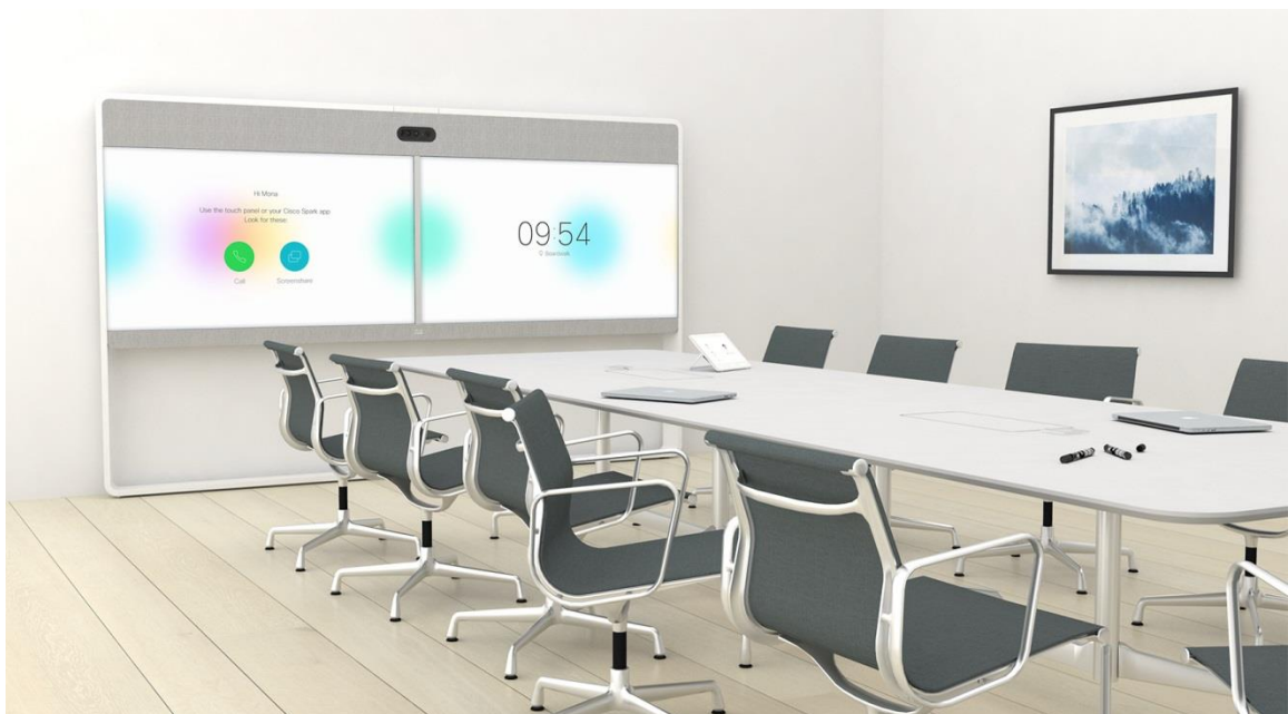
Figure 2. Cisco Spark Room 70 in large conference room