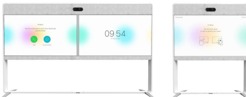
Figure 1. Cisco Spark Room 70 Dual and Cisco Spark Room 70 Single on Free-standing Floor Stand

* Integrated microphones for speaker tracking only