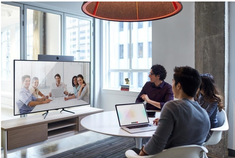
Figure 1. Cisco Spark Room Kit in Small Room Scenario

The Room Kit – which includes camera, codec, speakers, and microphones integrated in a single device – is ideal for rooms that seat up to seven people. It offers sophisticated camera technologies that bring speaker-tracking capabilities to smaller rooms. The product is rich in functionality and experience but is priced and designed to be easily scalable to all of your small conference rooms and spaces – whether registered on the premises or to Cisco Spark through the Cisco® Collaboration Cloud.